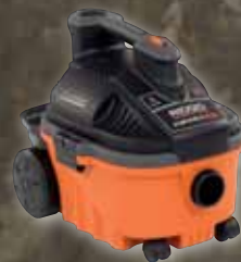
PORTABLE VAC WD4070 (SKU #476-085)