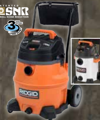
16 Gallon WD1851 (SKU #255-185) | Stainless Steel WD1956 (SKU #386-239)