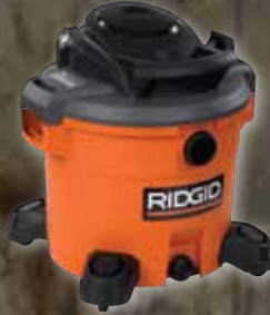
6 Gallon WD0670 (SKU #222-868) | 9 Gallon WD0970 (SKU #223-340)