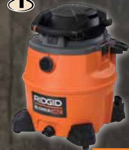
BLOWER VAC WD1680 (SKU #929-602)