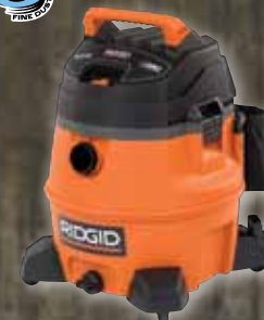
14 Gallon WD1450 (SKU #255-156)